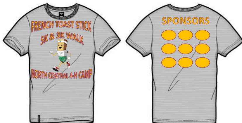
(actual t-shirt design may vary)